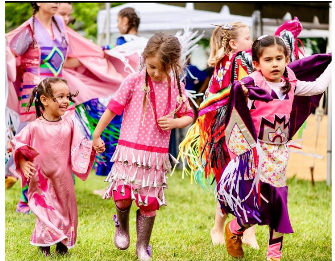
Little Indigenous girls at the Fort York Pow Wow June 23, 2018

https://thetyee.ca/Series/2018/09/03/All-Together-Healthy/